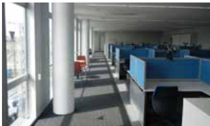
Office that actively brings in natural light