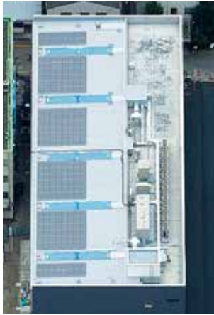
Rooftop solar panels