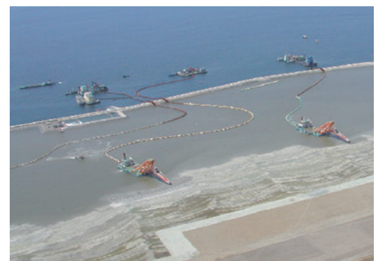
TOA's "Plug Magic" dredging method was adopted in order to maximize the recycling of dredged soft materials