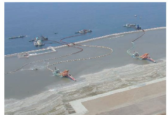
TOA's "Plug Magic" dredging method was adopted in order to maximize the recycling of dredged soft materials