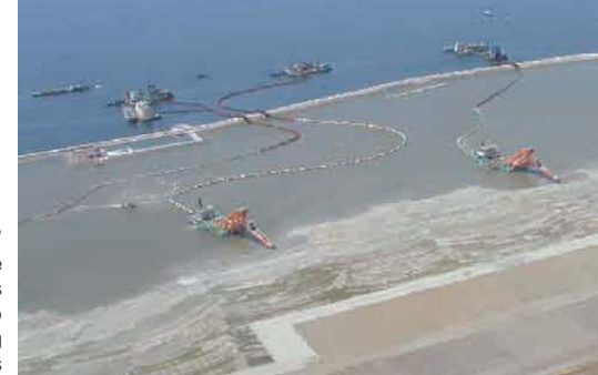
TOA's "Plug Magic" dredging method (see page 14 for details) was adopted in order to maximize the recycling of dredged soft materials